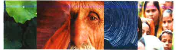
2017 LOTTIE MOON CHRISTMAS OFFERING