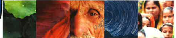
2017 LOTTIE MOON CHRISTMAS OFFERING