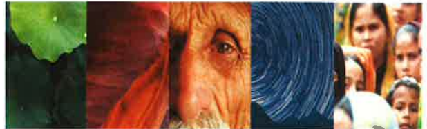
2017 LOTTIE MOON CHRISTMAS OFFERING 3